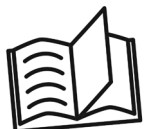
Bible Look Up Qs